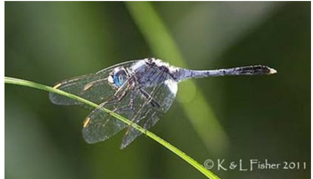
Chalky Percher – male

Leaden Flycatcher, Yellow-breasted Boatbill, Eastern Yellow Robin and Mistletoebird. Several dragonflies were around the grassy swamps including, Sapphire Flutterer, Palemouth, Painted Grasshawk and Chalky Percher.