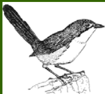
Carpentarian Grasswren Kevin Bartram © Birds Australia 2003

Volunteers are needed to assist in surveying for Kalkadoon and Carpentarian Grasswrens in July 2008. You would have to find your own way to Mt. Isa. Accommodation would be under canvas at the survey sites. Be warned the nights are cold! The aim is to assess the population densities of grasswrens in Spinifex fire scars of different ages. This is part of the Birds Australia North Queensland Group's Important Bird Area Monitoring Program.