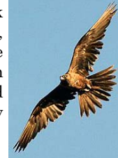
Black Falcon

named because of its dark wingspan of 97-115cm, similar to the Peregrine longer tail. The Black Falcon