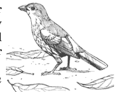
Tooth-billed Bowerbird Andrew Plant © Birds Australia 2003