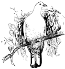
Pied Imperial Pigeon Ian Hance © Birds Australia 2003