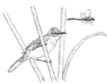
Calmorous Reed-Warbler Andrew Silcocks © Birds Australia 2003

Back to our digs or to a Cafe for breakfast then off along Orient Road. Beth and I took nearly an hour to traverse the 20kms as we were stopped more often than moving. We did miss the Australian Pratincoles that the forward party (who obviously ate less than I did and packed up more speedily) had seen, but after learning of their presence, had an excellent sighting of one on the return along the wet, sandy/muddy, cow-pat strewn road. Yes, I had to really work hard this morning to clean all the plastered-on mud from under the mudguards. Had just had the underbody rustproofed last week, so hope it had dried and did its job properly under those stringent conditions. We easily found the large gathering of Brolgas decorating a lagoon towards