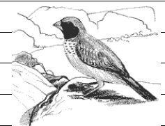
Pictorella Mannikin Steve Paton © Birds Australia 2003