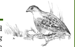
Buff-breasted Button-quail