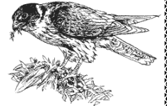
Australian Hobby Robert Mancini © Birds Australia 2003

Falcon ( Falco longipennis ) 66-87cm, its similar in size 'long feather' reflecting these cheeks, which form part of a