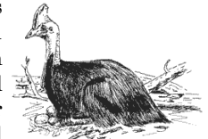
Southern Cassowary Non Lapinath © Birds Australia 2003

Negotiations between QPWS and Birds Australia have been conducted regarding the sharing of atlas data with the department in return for an in-kind contribution to IBA monitoring. For example, QPWS has already expressed a willingness to allocate some staff time to the project. Many departmental projects currently underway or under consideration will also assist in the IBA monitoring process. Below are a list of IBAs for north Queensland and the name of the person/s coordinating the monitoring effort. The List of bird species associated with each of these IBAs appeared in the March 2007 edition of Contact Call.