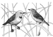
Yellow Chat Annie Rogers © Birds Australia 2003