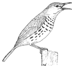
Bar-breasted Honeyeater Andrew Silcocks © Birds Australia 2003

On the Saturday morning before the AGM a morning walk was held around Kingfisher Park and the surrounding areas. The resident Papuan Frogmouth were roosting in the orchard.