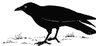
Torresian Crow

Within minutes of setting out we came across a paddock where a bean crop - probably navy beans had been reaped. The paddock was full of ( Red-tailed ) Black-Cockatoos and ( Torresian ) Crows feeding. I was intrigued; would the litter from a harvested bean crop harbour sufficient insects to interest so many crows or were they feeding on the spilled beans? Three Pale-headed Rosellas came out of and went