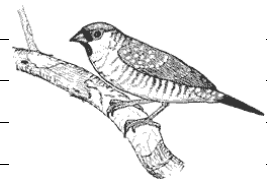
Plum-headed Finch