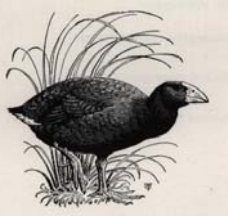
Ornithological Society of New Zealand

T he Fourth Biennial Australasian Ornithological Conference will be held in Perth, Western Australia on 3 rd to 5 th of December 2007. This conference provides a regular forum for the exchange of information and ideas between avian researchers and conservationists throughout the Australasian region. The venue will be the University of Western Australia, and the Western Australian group of Birds Australia (RAOU) will host the conference. A post-conference field excursion will be available.