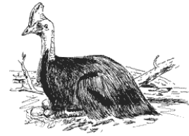
Southern Cassowary Nan Lapinath © Birds Australia 2003

Please remember that this is a wilderness area and one should be self sufficient. For further information, please contact Alan Gillanders on Ph (07) 4095 3784 or email spotlighting@cyberwizards.com.au .