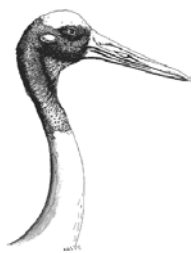
Sarus Crane Kate Gorringer-Smith © Birds Australia 2003