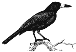
Black Butcherbird

Whilst conducting an early morning bird walk around Kingfisher Park Birdwatchers Lodge, Julatten on 3 rd August 2006 my attention was drawn to the scalding calls of Yellow-spotted Honeyeater Meliphaga notata and Large-billed Scrubwrens Sericornis magnirostris . The birds had found, amongst the rainforest understorey, an adult Black Butcherbird Cracticus quoyi who was jabbing at something on the ground. After several minutes the butcherbird hopped onto a low branch gripping a one metre long Green Tree Snake Dendrelaphis punctulata in its bill. The snake was presumed dead as it was not making any movements. The butcherbird was holding the snake behind the head and proceeded to hop up a tree until it disappeared out of view about five metres from the ground. The Handbook of Australian, New Zealand & Antarctic Birds Vol 7 part A (2006), lists lizards as the only prey item recorded for reptiles. This is shown as a reference to Hall in the text but not shown in the reference section at the end of the species description. Other references from various sources I found are vague and give reptiles as food items without any qualification. I'm not aware of any records which specifically state that snakes are a food item but would like to hear from anyone who knows of a reference or has seen this before. It could be a new recorded food item.