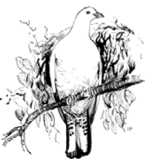
Ian Hance © Birds Australia 2003