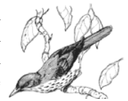
Andrew Plant © Birds Australia 2003.

A small group of members met up in Dimbulah and drove out to the Mt. Mulligan Station homestead, about a 2 ½ hour drive from Cairns. The station homestead (385 m above sea-level) used to be the hospital for the once thriving town built to service the coal mine located here. Mt Mulligan forms a backdrop on one side of the homestead and was discovered by James Venture Mulligan who explored and named the area in 1874. At the time there was little interest in the area as all attention was focused on the rich gold deposits on the Palmer River. In 1910 coal mining started at Mt. Mulligan. A new mining town was built and in 1914 a railway branch line from Dimbulah was established. The town prospered until 19 September 1921 when an underground explosion killed 75 miners. At the time this accounted for every miner working in the mine (a memorial is now erected in the memory of those killed). They are all buried in the local cemetery. It was one of Australia's worst mining disasters and is still the worst to have occurred in Queensland. The mine was closed down