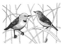
Annie Rogers © Birds Australia 2003.